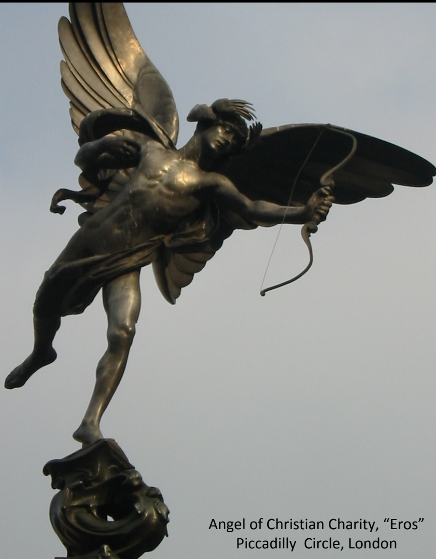
Angel of Christian Charity, "Eros" Piccadilly Circle, London